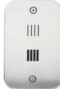
Sensorflush standard touchpad Colour: Stainless steel/black flush logos Part # HYD-52313