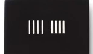
Sensorflush touchpad Colour: Jet Black/Silver, sterling silver inlay Part # HYD-S2356