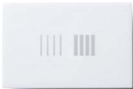
Sensorflush touchpad Colour: Glacier White/Grey Part # HYD-S2320

A choice of contemporary colours, from minimalist white to models inlayed with gold or silver.