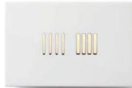
Sensorflush touchpad Colour: Glacier White/Gold, 9ct gold inlay Part # HYD-S2330