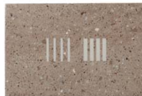
Sensorflush touchpad Colour: Sonora/Grey Part # HYD-S2335