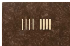
Sensorflush touchpad Colour: Raphael/Gold, 9ct gold inlay Part # HYD-S2370