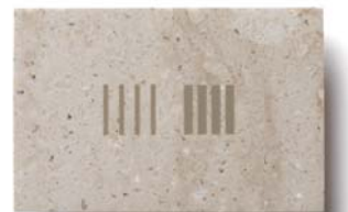
Sensorflush touchpad Colour: Tumbleweed/Grey Part # HYD-S2342