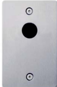
Sensorflush standard urinal touchpad Colour: Stainless steel/black flush logos Part # HYD-801