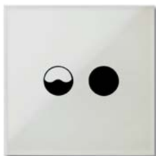
Sensorflush glass tile touchpad Colour: Ivory-backed glass tile with black flush logos Part # HYD-874

Just a gentle finger touch to the pad will flush the toilet.