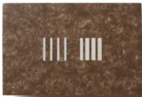
Sensorflush touchpad Colour: Raphael/Grey Part # HYD-S2360