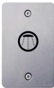
Sensorflush timed shower controller Colour: Stainless steel/black logos Part # HYD-877 (On/Off) Part # HYD-897 (Pretimed)