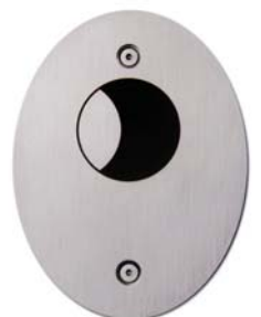
Sensorflush standard touchpad Colour: Stainless steel/black flush logos Part # HYD-798