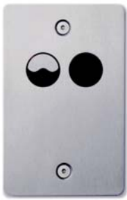
Sensorflush standard touchpad Colour: Stainless steel/black flush logos Part # HYD-802

Engineered to last, the Sensorflush touchpad coupled with the low maintenance flush valve is 4 Star WELS rated and is also suited for use with 3 Star WELS rated pans. The patented touch technology, and flush products have been considered leaders in their field since 1992.